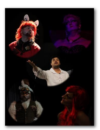
The Little Mermaid