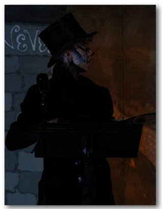
The Afterlife Radio Show